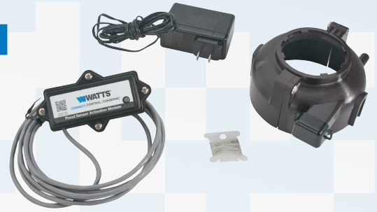
BMS Sensor Retrofit Connection Kit Shown

994/957 with SentryPlus Alert® Technology