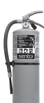
SENTRY 10 LB EXTINGUISHER