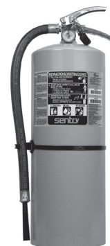
SENTRY 20 LB EXTINGUISHER